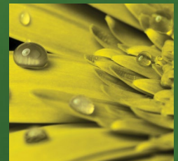
elite ROOF OUTLET SYSTEMS