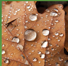
traditional RAINWATER SYSTEMS