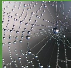
aligator RAINWATER SYSTEMS