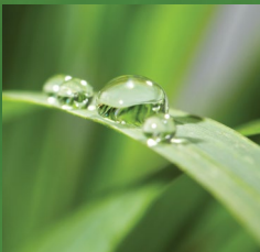
evolve RAINWATER SYSTEMS

The hoppers are supplied in protective polythene sleeving and components packed in cardboard boxes. If polyester powder coated products are stored outside, cover with tarpaulin to guard against water ingress. If water becomes trapped within the polythene wrapping and left exposed to warm sunlight, it may leave permanent water stains on the paint finish.