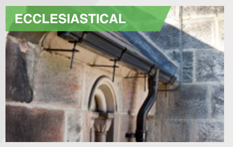
Traditional Moulded Ogee gutter, Traditional downpipe