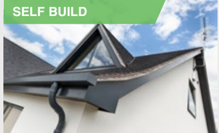
Aligator Boxer gutter, Traditional downpipe, Evoke fascia and soffit