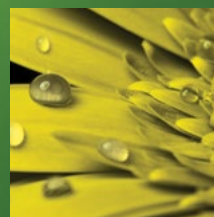
roof OUTLET SYSTEMS