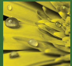
elite ROOF OUTLET SYSTEMS