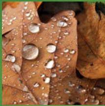
traditional RAINWATER SYSTEMS