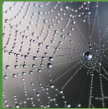
alligator RAINWATER SYSTEMS