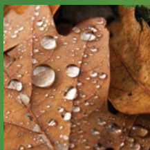
traditional RAINWATER SYSTEMS