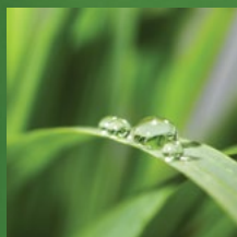
evolve RAINWATER SYSTEMS

All gutter and pipe lengths are supplied in protective polythene sleeving and components packed in cardboard boxes. If polyester powder coated products are stored outside, cover with tarpaulin to guard against water ingress. If water becomes trapped within the polythene wrapping and left exposed to warm sunlight, it may leave permanent water stains on the paint finish.