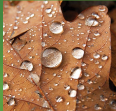
traditional RAINWATER SYSTEMS