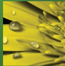
roof OUTLET SYSTEMS