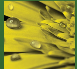
elite ROOF OUTLET SYSTEMS