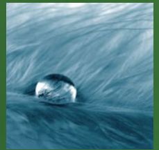
shower OUTLET SYSTEMS