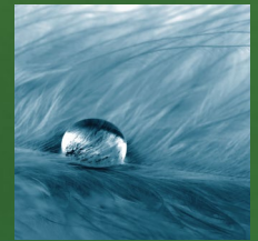
shower OUTLET SYSTEMS