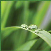
evolve RAINWATER SYSTEMS

All goods should be stored under cover to protect against ingress of water between surfaces of composite aluminium sheets. Flat panels should be stored fully supported on a flat surface. Profiled lengths should also be fully supported throughout the product length and appropriately stacked to avoid damage to the profile. Ensure that the self-adhesive peel off protective cover is not damaged during handling exposing the painted surface to potential damage.