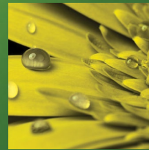
roof OUTLET SYSTEMS