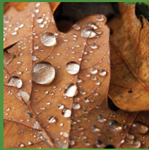
traditional RAINWATER SYSTEMS