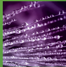
evolve FASCIA, SOFFIT & COPING