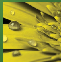
roof OUTLET SYSTEMS