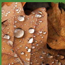
traditional RAINWATER SYSTEMS