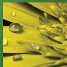
roof OUTLET SYSTEMS