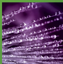
evolve FASCIA, SOFFIT & COPING