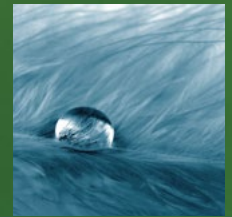
shower OUTLET SYSTEMS